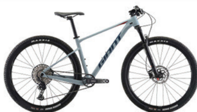
2 - MOUNTAIN BIKES