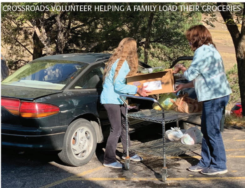
CROSSROADS VOLUNTEER HELPING A FAMILY LOAD THEIR GROCERIES

"It is a joy to share this bit of my government stimulus money with you! Your help with the security deposit for this wonderful apartment that I'm living in now allowed me to get out of a 1-room log cabin with no running water for 13 years and move into a new and much better life! Before that your help with food, firewood, vouchers for laundry and showers kept me alive and able to keep working toward this goal! Thank you for all that you do for so many! With love..."