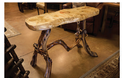
HANDCRAFTED ENTRYWAY TABLE